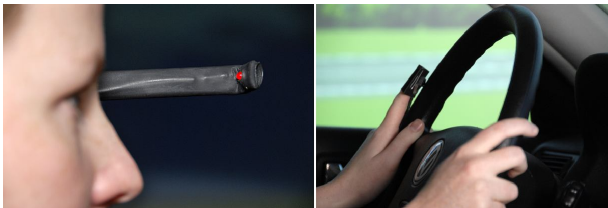
Figure 2 - Headband with LED in peripheral vision of participant (left); PDT switch on left index finger (right)

There are however secondary tasks that are not obtrusive and are also not embedded in the driving task, such as the Peripheral Detection Task (PDT). The PDT is based on the fact that visual attention narrows as workload increases [27]. Originally, the PDT was applied in a driving simulator setting with the stimulus presented on the simulator screen. In later studies, drivers wear a headband with a LED in their peripheral field, so that the LED moves with the drivers' head movements [28]. The LED lights up randomly every 3 to 5 seconds. Drivers also wear a small switch attached to their index finger (Figure 3), which they are instructed to press every time they notice the LED light. In general, the index finger of the dominant hand is chosen for this, unless the experimental setup does not allow for this (e.g., with manual transmission).